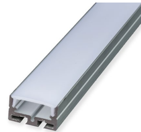
MCS173 With Diffuser