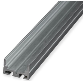
MCS172 Without Diffuser