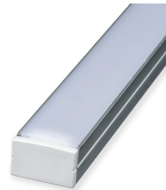
EL-CAP-166 on MCS172