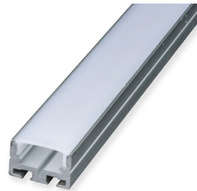
MCS172 With Diffuser