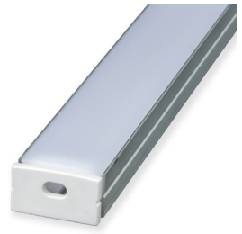
EL-CAP-167-h on MCS173

Magnets can be repositioned anywhere in the channel.