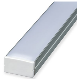
EL-CAP-167 on MCS173