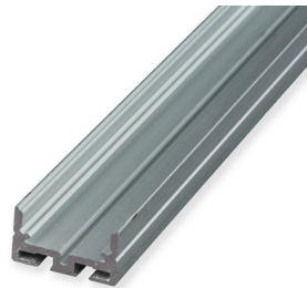
MCS173 Without Diffuser