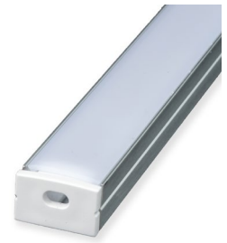
EL-CAP-166-h on MCS172