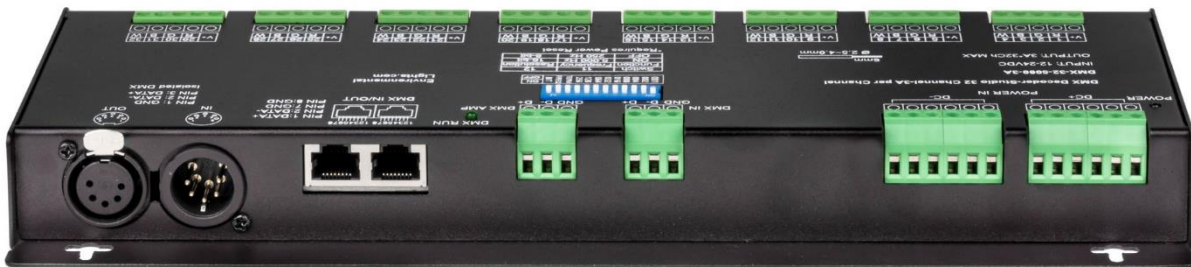
Figure 3: Connections