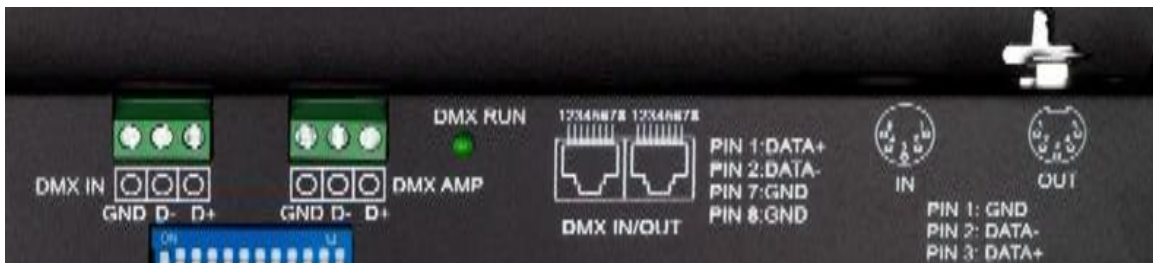
Figure 2: Connection Pin-Outs