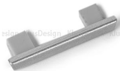
end cap TEST-36 (24040) TETRA-36 MET (24055)