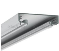
mounting base TESPO KPL. (18020)