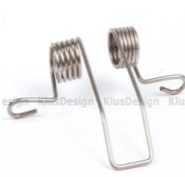
spring KMA (00838)