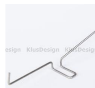
spring GP (00293)