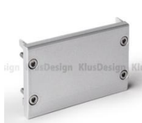
end cap SEPOD-MET KPL. (24106)