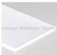
cover SZER (17081)