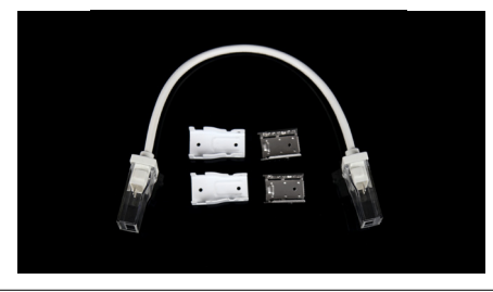
Eluxtra™ ProFlex LED Neon, 4-Wire Jumper PF-4-SPS-JUMP-300mm

This is a 4-wire, IP68 jumper designed to connect two sections of Eluxtra™ ProFlex LED strip lights that have been cut to custom lengths. Look for the "01" and "02" markings on your strip light to ensure you are connecting in the proper direction.