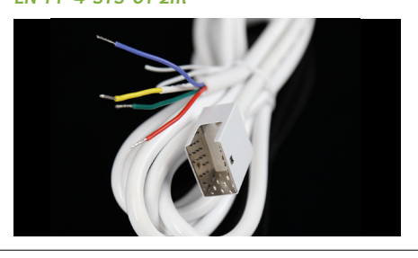
Eluxtra™ ProFlex LED Neon, 4-Wire Connector 01 LN-PF-4-STS-01-2m

This is a 4-wire, IP68 connector designed for use with Eluxtra™ ProFlex LED strip lights. It features a 2-meter lead, providing flexibility for various setups. Look for the "01" marking on your strip light to ensure you are connecting in the proper direction.