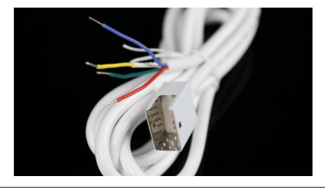
Eluxtra<sup>™</sup> ProFlex LED Neon, 4-Wire Connector 02 LN-PF-4-STS-02-2m

This is a 4-wire, IP68 connector designed for use with Eluxtra™ ProFlex LED strip lights. It features a 2-meter lead, providing flexibility for various setups. Look for the "02" marking on your strip light to ensure you are connecting in the proper direction.