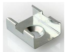
mounting bracket zinc (1072) chrome matt (1345)