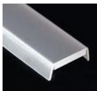
cover type HS frosted (1369) clear (1370)