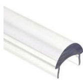
cover type S clear (00220)