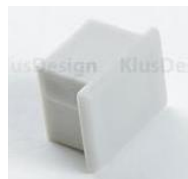
end cap without hole (1056) with hole (1057)