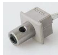
electricity conductive end cap (1407)