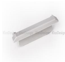
end cap OBIT (24127)