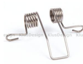
spring KMA (00838)