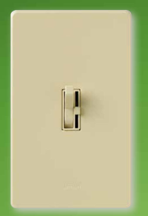
NEW Ariadni<sub>®</sub> 250 W C·L dimmer