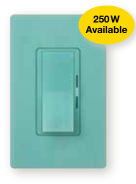
Diva<sub>®</sub> in Sea Glass