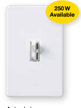
Ariadni<sub>®</sub> in White