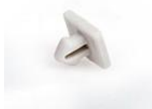
TEKNIK clip (24003)