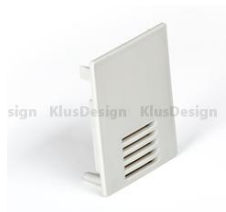
end cap INTER (24011)