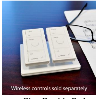
Lutron Pico Double Pedestal <u>L-PED2-WH</u>