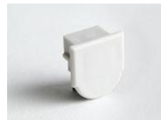
End Cap Without hole (00310) With hole (00313)