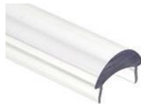
Cover Type S (00220)