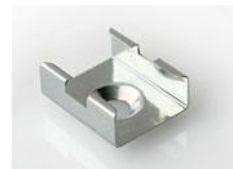
Mounting Bracket Zinc (1072) Chrome matte (1345)