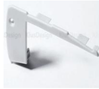
end cap STEP-R, right (00303) STEP-L, left (00304)