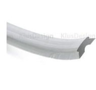
anti-slip rubber strip (00297)