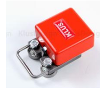
tool for mounting anti-slip rubber strip (00023)