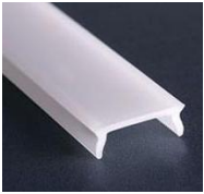
cover type K / KA-BIS frosted (1547/17071) clear (1548/17072) cover type LIGER frosted matte (17031)