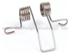
spring KMA (00838)