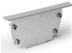
end cap SEKODU KPL. (24107), SEKODU-MET KPL. (24108)