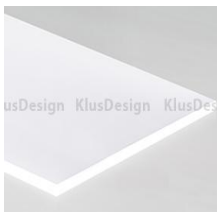
cover SZER (17081)