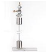
fastener MULTIBO (soon in our offer)