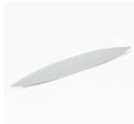
end cap B (soon in our offer)