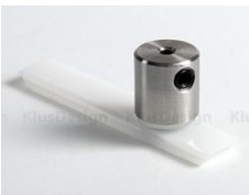
fastener MULTI (00214)