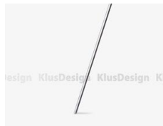
brass rod chrome matt 1m (42501) chrome matt 2m (42502)