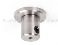
longitudinal fastener for drywall ceiling (1559) for wall (00093)