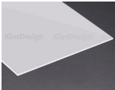
cover type MULTI frosted (00428) clear (00435) cover type MUN clear matte (17041)