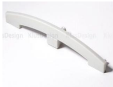
end cap MULTI - A (00305)