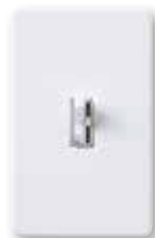
Ariadni® C•L Gloss colors (excluding gray)