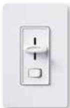
Skylark® C•L Gloss colors