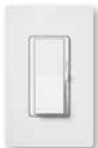
Diva® C•L Gloss and Satin Colors