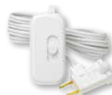
Credenza® C•L Black (BL), White (WH), & Brown (BR)