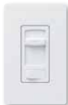
Skylark Contour® C•L Gloss colors