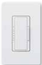
Maestro® C•L Gloss and Satin Colors®

Available in a variety of aesthetic styles and colors to match any décor