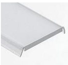
cover type HS22 frosted (17011) clear (17022)