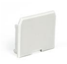
end cap KOZEL without hole (24034)