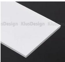
cover type HSP47 frosted (17051) clear (17062)