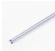
security rod (00806)